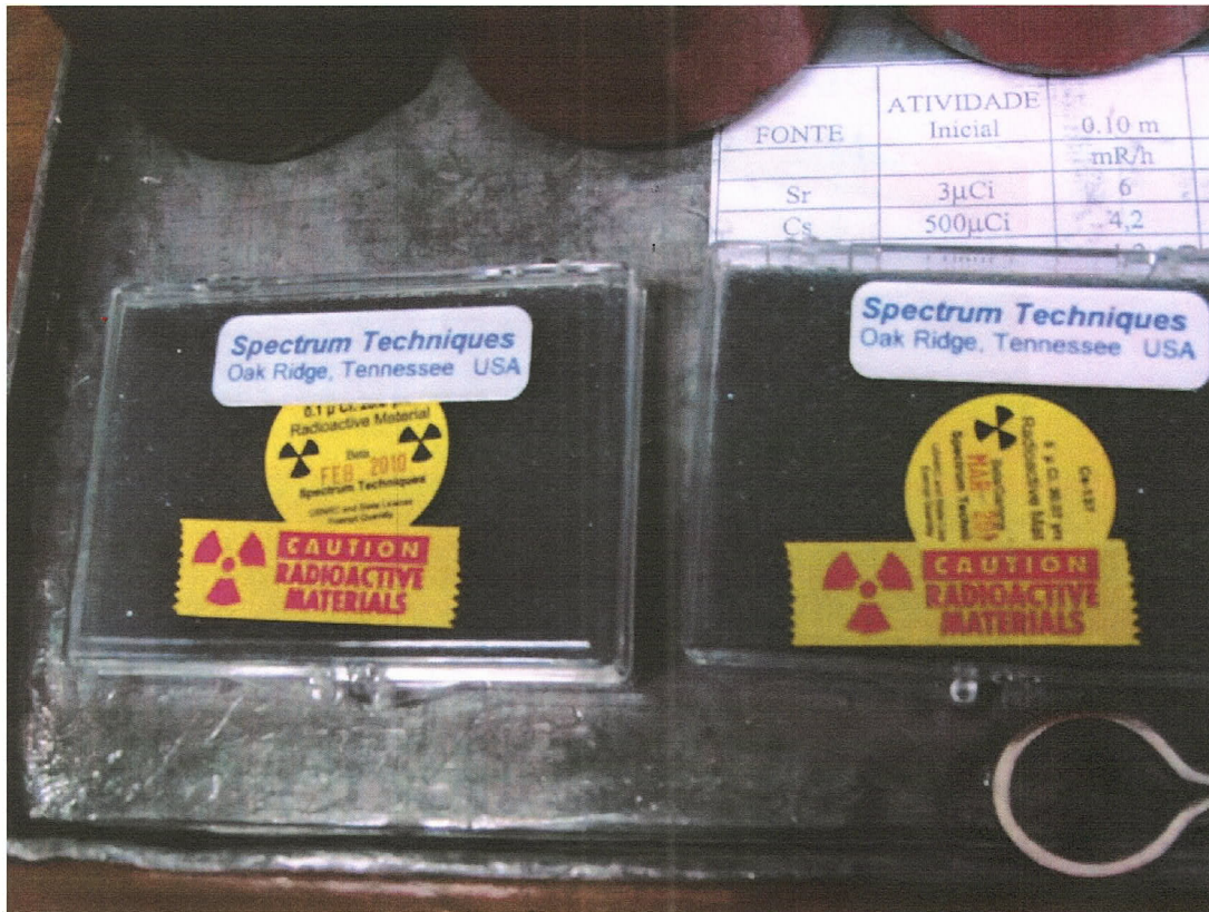
FOTO DAS PASTILHAS DE Cs E Sr ADQUIRIDAS EM 2010