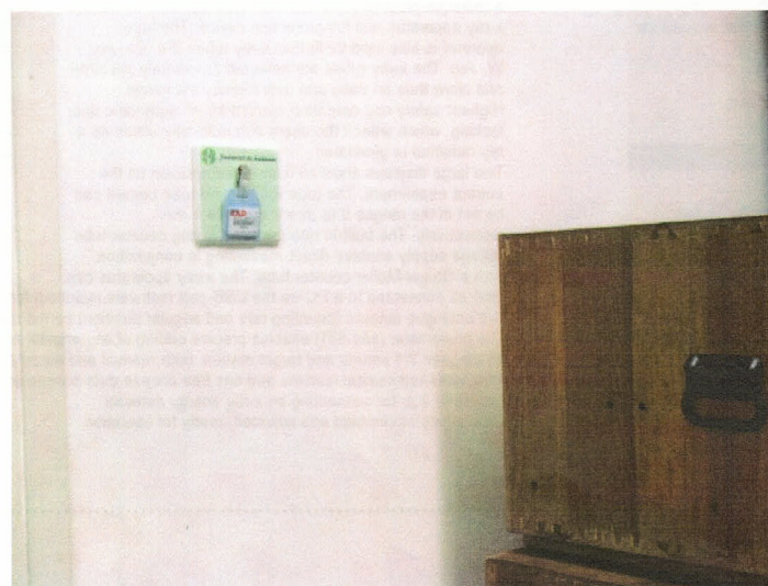
FOTO DO DOSIMETRO DE AMBIENTE