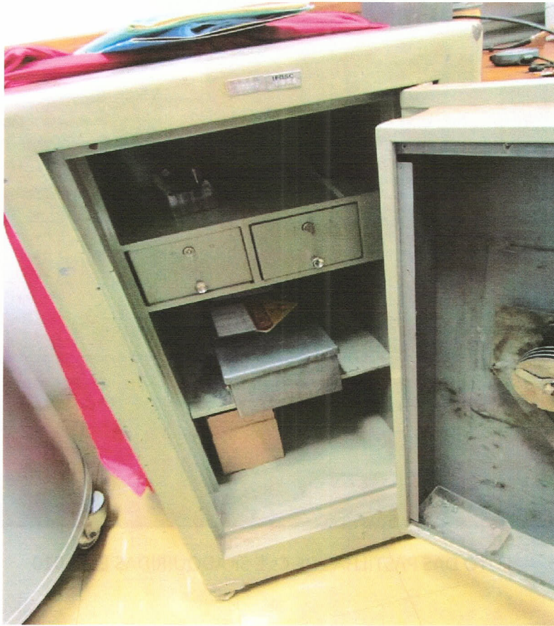
FOTO DO COFRE ABERTO COM A CAIXA DE FONTES